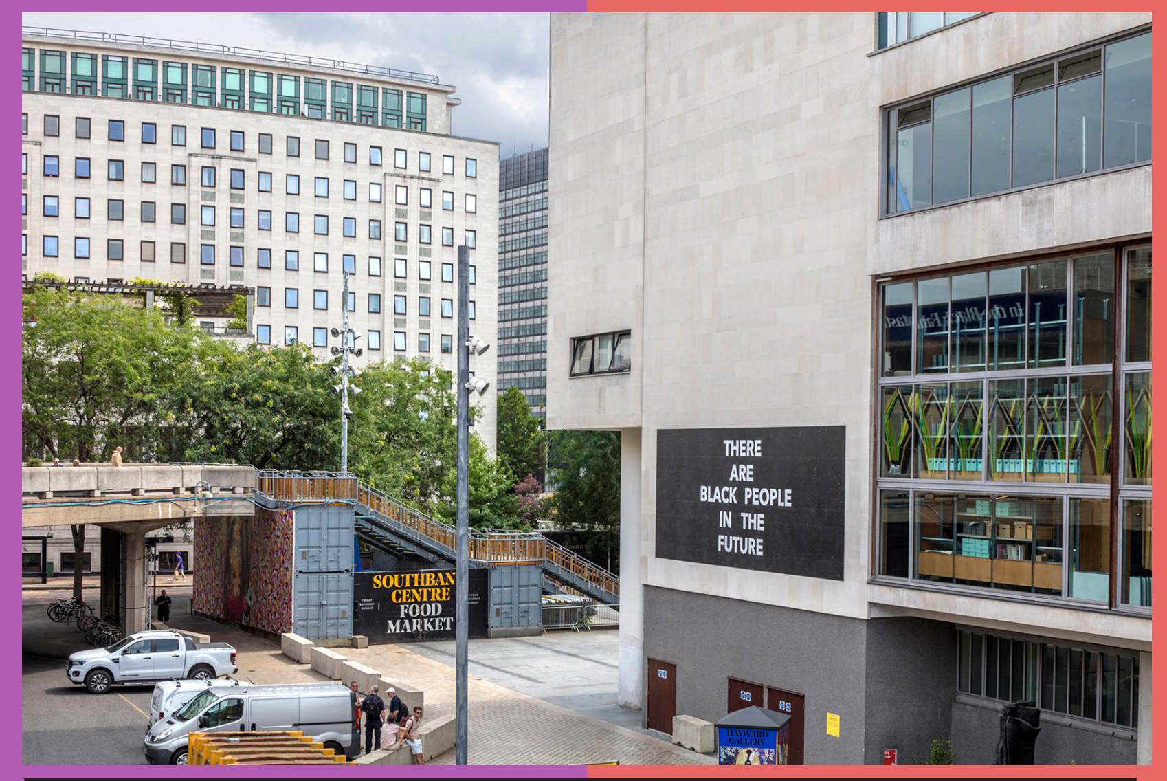
Alisha Wormsley, There Are Black People in the Future, 2022. Installation view at the Southbank Centre, part of the exhibition In The Black Fantastic (2022). © the artist.