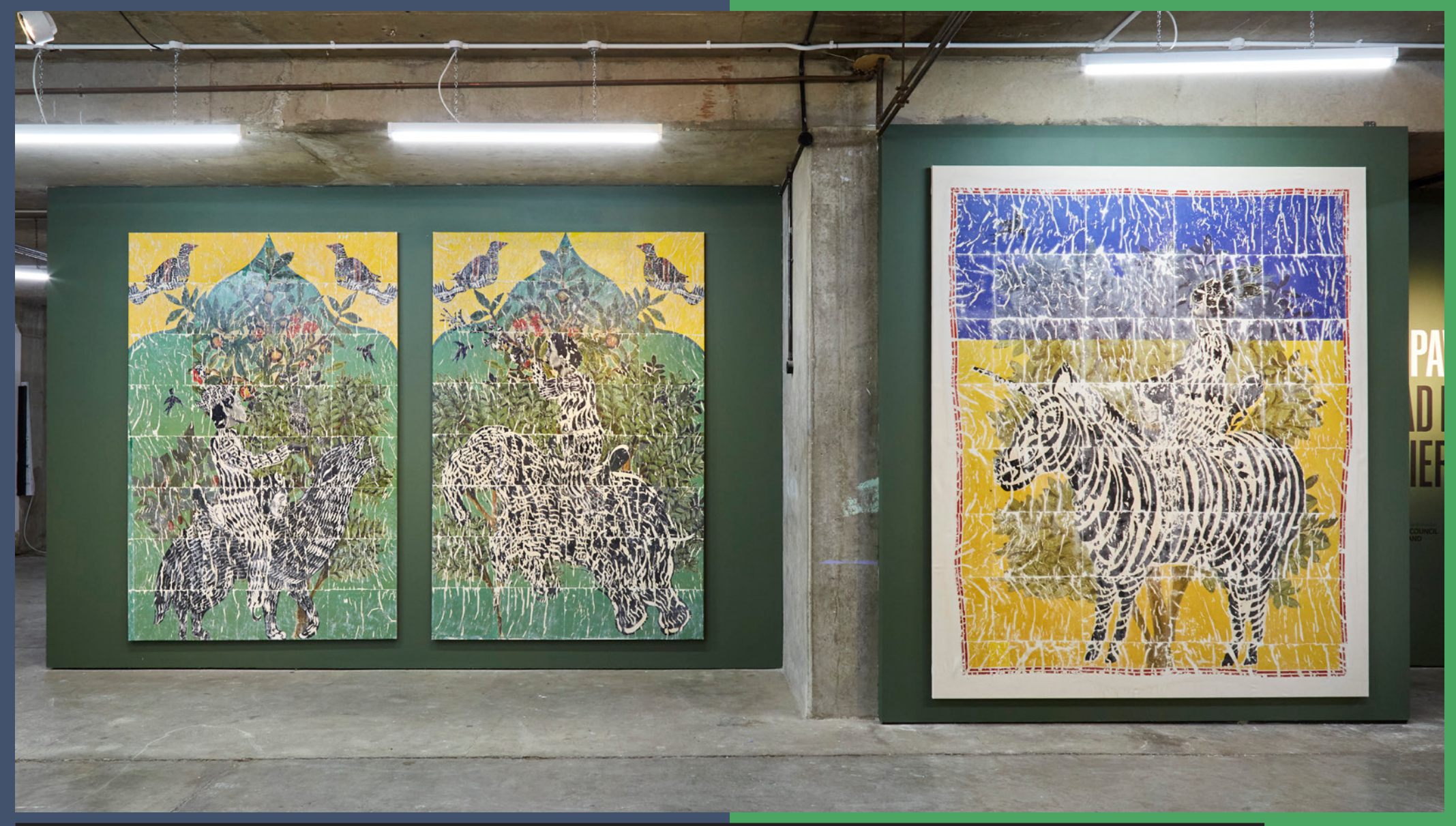
Mohammad Barrangi, The Mythical Creatures of Eden, 2021, installation view, Diaspora Pavilion 2: London (2022).