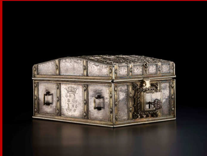
Mary Queen of Scots Silver casket, by unknown maker