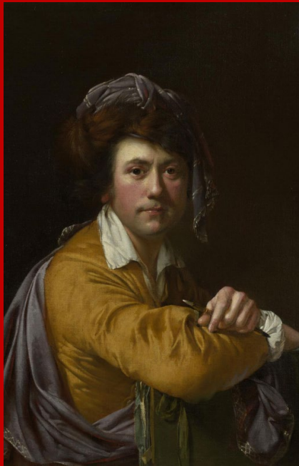
Self-Portrait at the Age of about Forty by Joseph Wright of Derby

Art Fund is, and always will be, the National Charity for Art