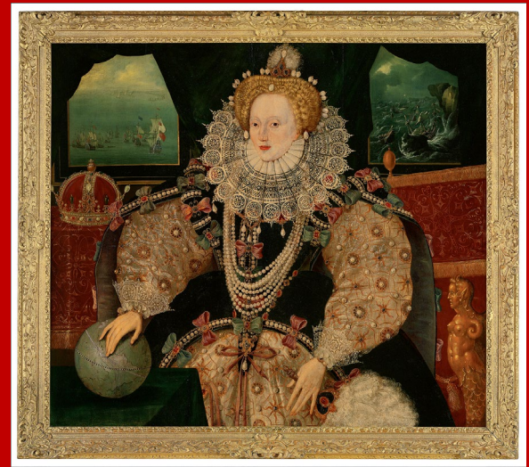
The Armada Portrait of Elizabeth I, by unknown artist