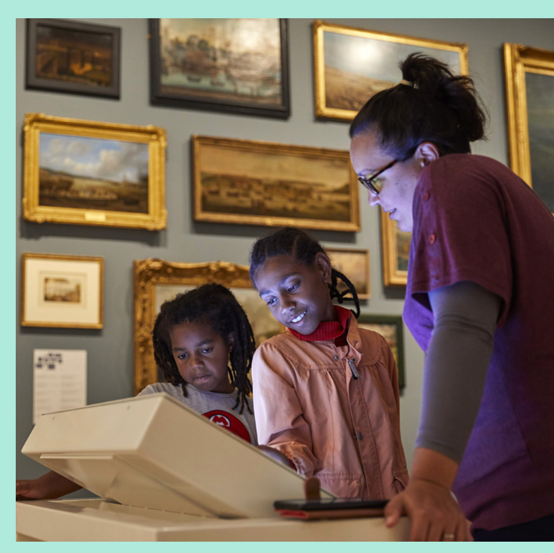
Visitors at The Box, Plymouth, August 2021

As a funder, we would like our approach to be straightforward and flexible. If you have any issues when applying for a grant, please email programmes@artfund.org.