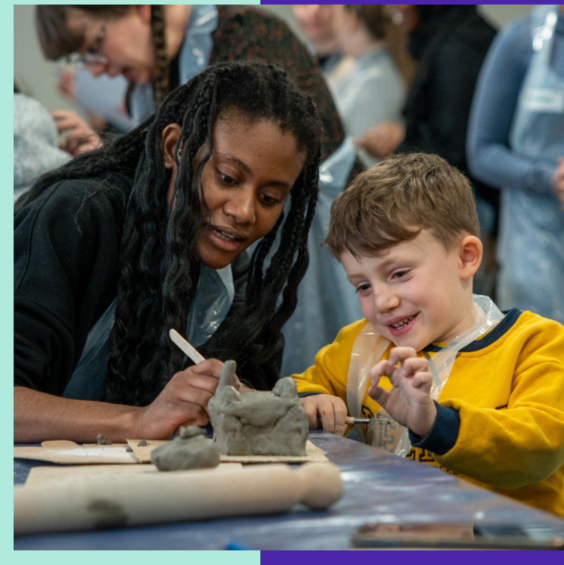
Family workshop

Reimagine Grants are funded by Art Fund with support from The Headley Trust, alongside other generous trusts and supporters of the Making Connections campaign.